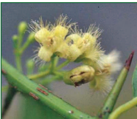
Figure 2. Flowers of Ximenia americana , thorn evident at right.

Tallow wood is a straggly often multi-stemmed shrub reaching a height of ten feet with alternate, shiny rather thick leaves and thorny spur shoots (Fig. 1). Flowers are creamy-white with abundant hairs on the four petals (Fig. 2).