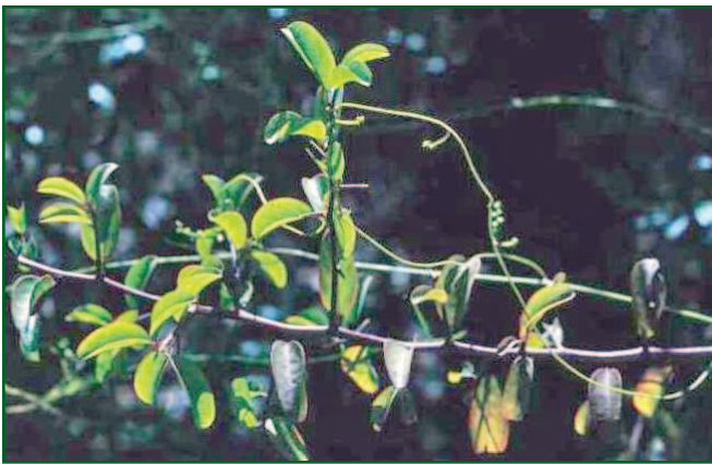
Figure 1. Two cosmopolitan parasites making connection in Florida: Cassytha filiformis (the vine right center) parasitizing the parasitic shrub Ximenia americana .

In an earlier issue of Chinquapin , I wrote about Cassytha filiformis , a parasitic vine that is pan-tropical in its distribution. Joining that elite club along with such notables as coconut and various sea beans is the parasitic shrub of southern Florida sometimes known as hog plum. Several other plants in the Caribbean are called hog plum, so I am, with minor reluctance, using tallow wood as a common name, a reference to use as firewood and probably also to a valued oil expressed from the large seeds. In fact, tallow wood, Ximenia americana , has the largest seeds of any of our North American parasitic plants, about the size of a medium olive. The genus name honors the Spaniard Francisco Ximeniz, a Dominican priest credited with preserving a Mayan history in the early 1700s.