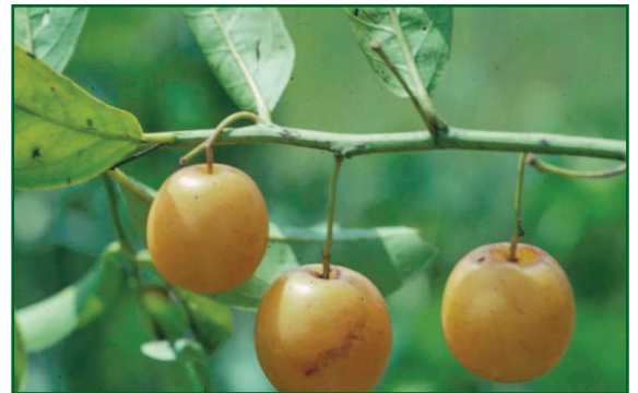
Figure 3. Fruits of Ximenia near Sebring, Florida.

The fruits (Fig. 3) bear a close resemblance to a plum hence the common name hog plum. Fruits are lemon yellow,