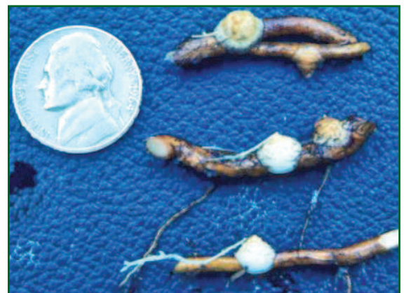
Figure 4. Haustoria of Ximenia americana on unidentified woody host in Florida. The clasping nature of the haustoria is evident in the folds below the main body of the parasitic organ.

Ximenia americana is a root parasite with a broad host range though in Florida I have found it chiefly on woody hosts. The haustoria (Fig. 4) are large and distinctive in the way they wrap around the host root, a feature of other members of its family, the Olacaceae.