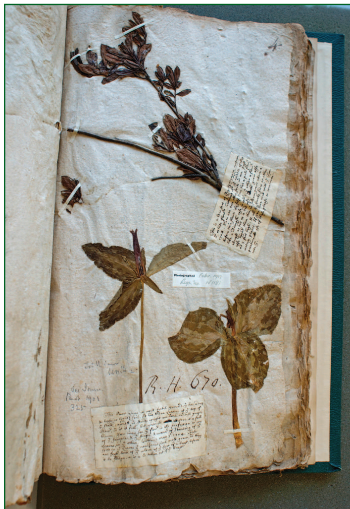
Joseph Lord's specimen of Trillium maculatum Raf. (H.S. 284 f. 4)