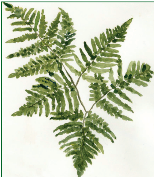
Figure 1. Leaf of Pteridium aquilinum .

Bracken ( Pteridium aquilinum ) is said to be one of the five most common plants in the world. Standing up to five feet high (but usually about 2.5 feet), it is the coarse leathery fern you have almost certainly encountered in disturbed areas, thickets, and dry open woodlands.