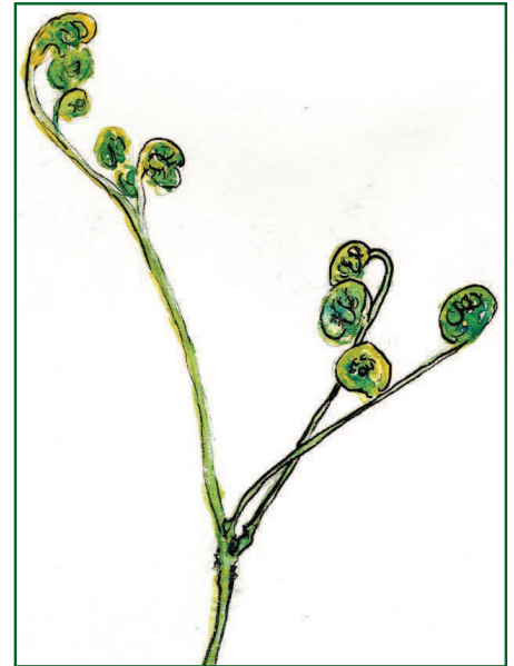
Figure 2. Young frond of Pteridium aquilinum , showing unrolling fiddleheads.

Not many observers have anything positive to say about bracken. But I do. Ferns as a plant type have for millions of years explored the possibilities of leaf form and function. Ever attentive, Thoreau, as usual, summed it up: "Nature made ferns for pure leaves to show what she could do in that line." Bracken